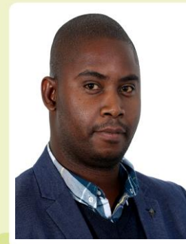
STATS SA OFFICIAL