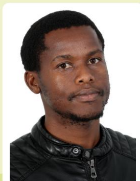
STATS SA OFFICIAL