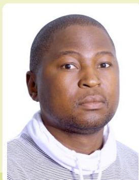
STATS SA OFFICIAL