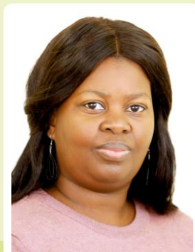
STATS SA OFFICIAL