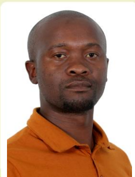
STATS SA OFFICIAL