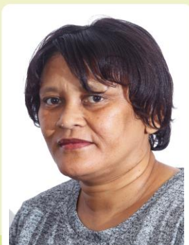
STATS SA OFFICIAL