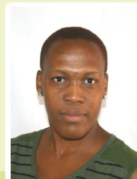
STATS SA OFFICIAL