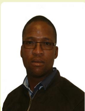
STATS SA OFFICIAL