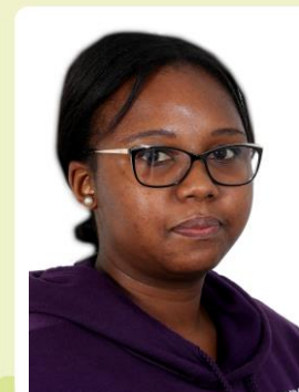
STATS SA OFFICIAL