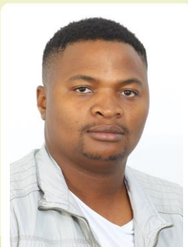
STATS SA OFFICIAL