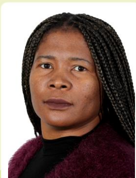
STATS SA OFFICIAL