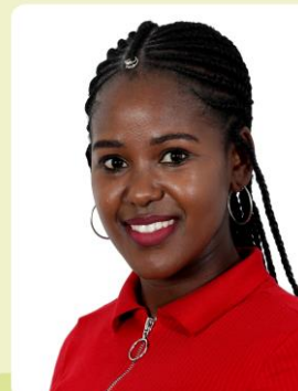
STATS SA OFFICIAL