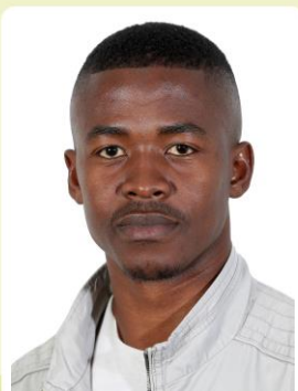
STATS SA OFFICIAL