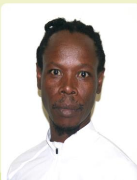
STATS SA OFFICIAL