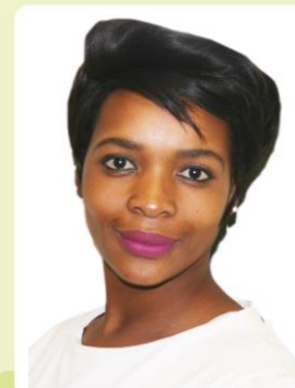
STATS SA OFFICIAL