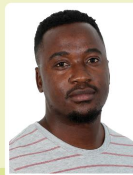
STATS SA OFFICIAL