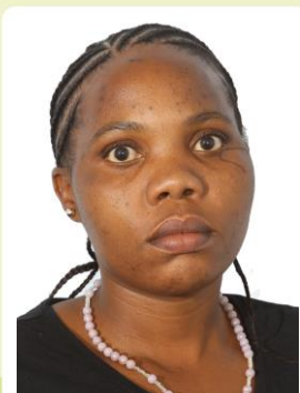
STATS SA OFFICIAL