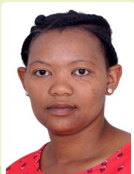
STATS SA OFFICIAL