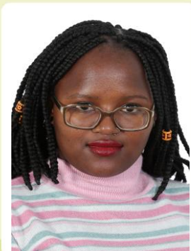
STATS SA OFFICIAL