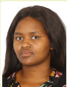
STATS SA OFFICIAL